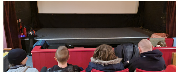
Above: Students waiting for the film to start at The Northern Lights Cinema in Wirksworth.

Meanwhile, students from the Special School went on a visit to The Northern Lights Cinema, in Wirksworth, to see Clifford. They had a fantastic time and were very grateful to Into Films who gave them the opportunity. They also made some microwave popcorn as a little treat. It was a fantastic little cinema and they will definitely be going again.